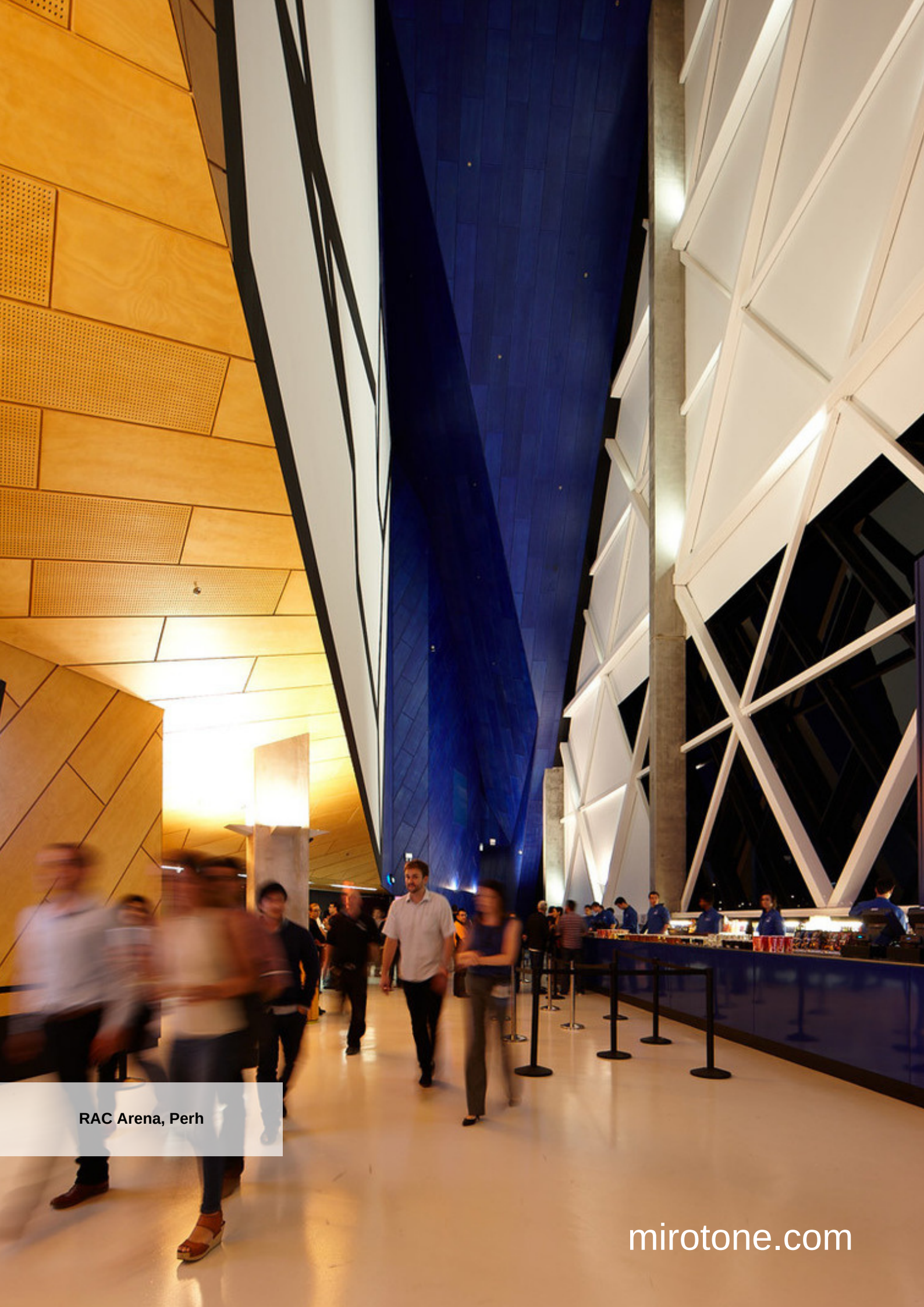
RAC Arena, Perth