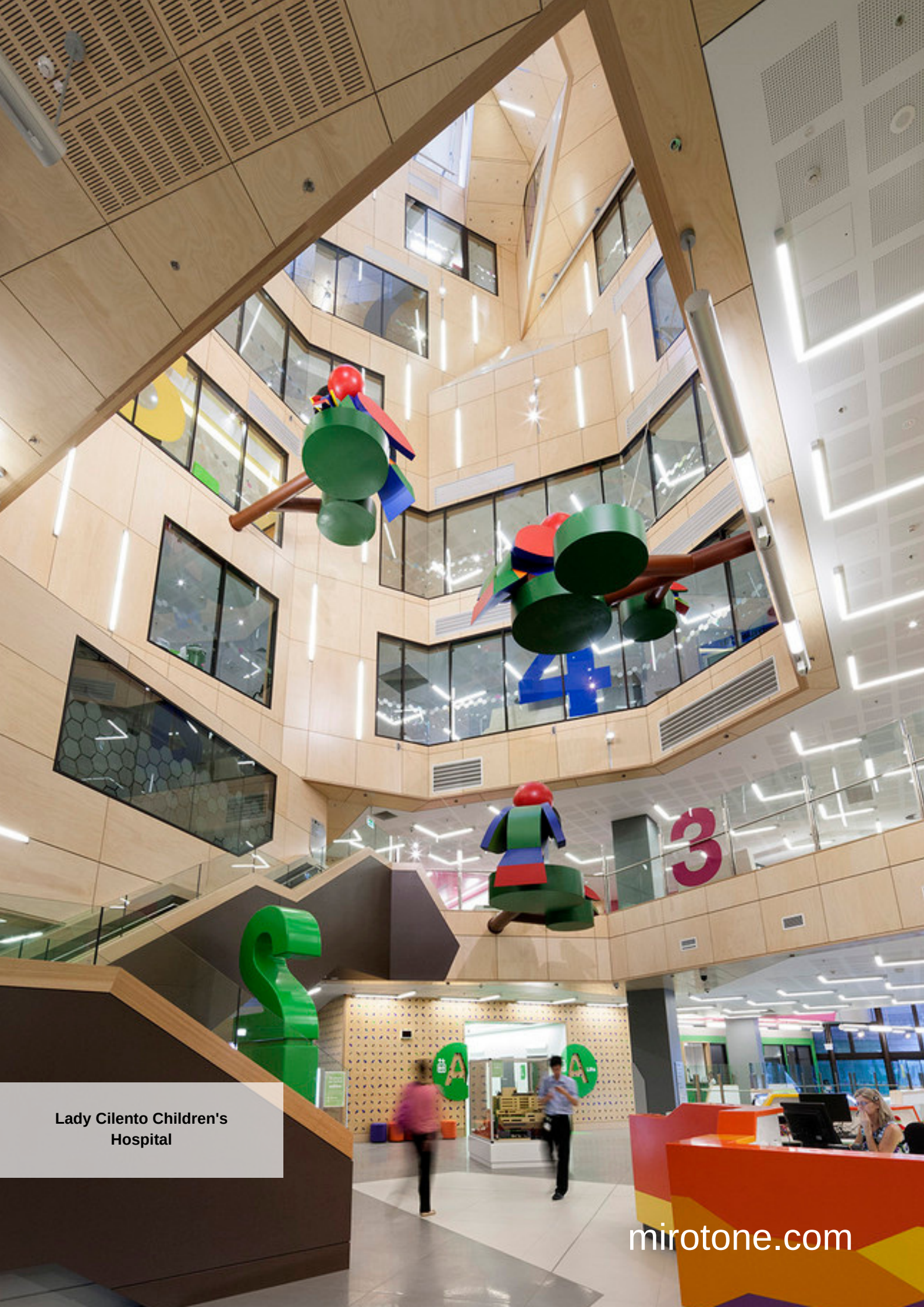
Lady Cilento Children's Hospital